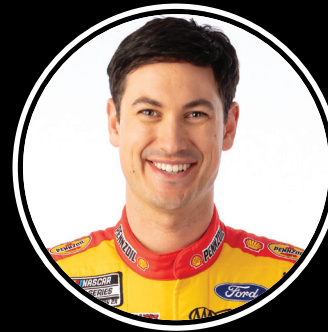
Founding Chairman JOEY LOGANO